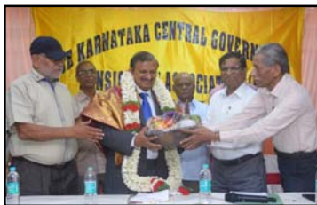
Felicitating of the Chief Guest