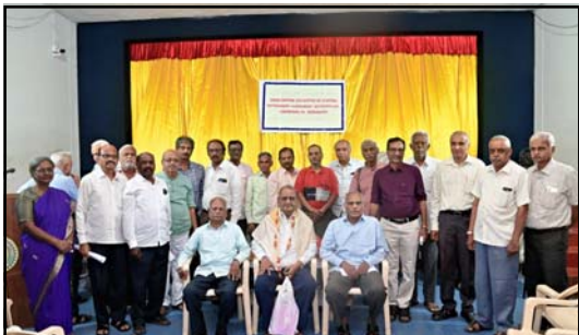
Chief Guest with Representatives of Pensioners Associations