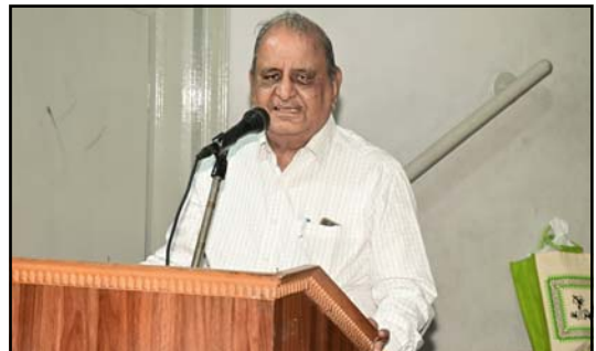
Chief Guest addressing the Pensioners