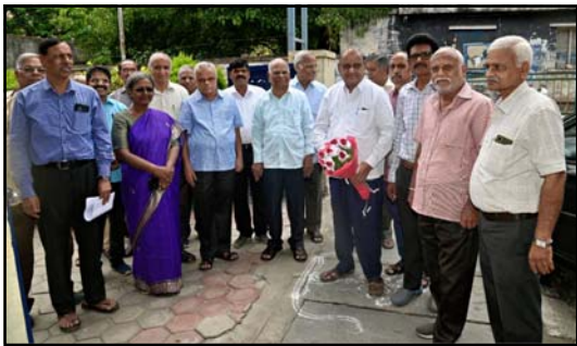
Arrival of the Chief Guest