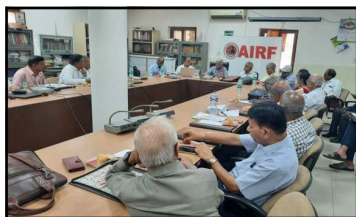
NCCPA National Executive Committee meeting in progress