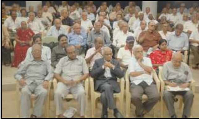
Sections of Audience